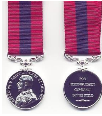
Distinguished Conduct Medal

Pte Laidlaw was discharged to Base Details at Trouville on 20 th December, 1917 & marched in to A.G.B.D. at Havre the same day.